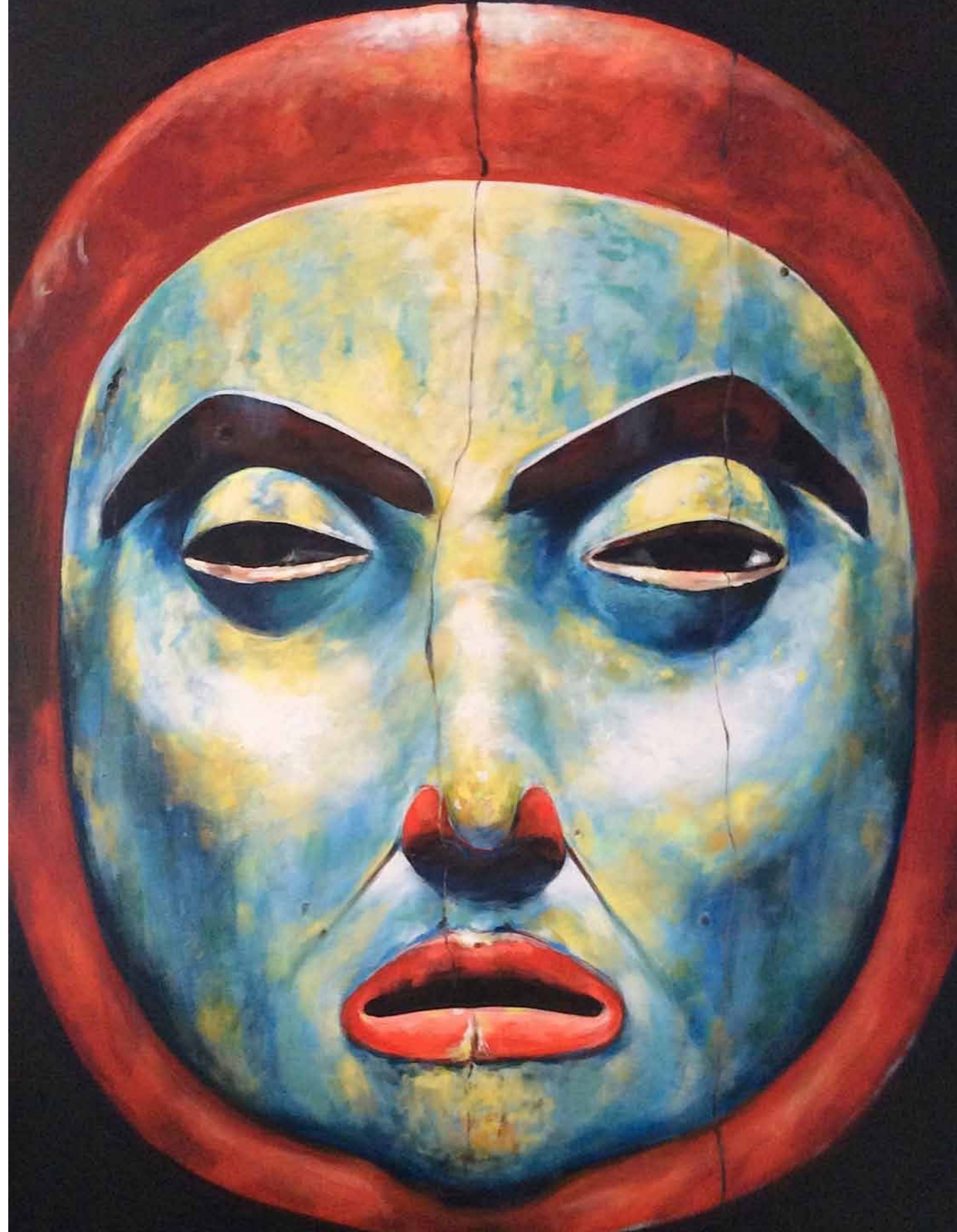
right, Mystere Rouge , acrylic on canvas, 39" x 55"

for posterity, he is unconcerned about eventual homogeneity in his artistic production. Yet, it seems there is a predominant guiding principle in all his creations, the same mastery of technique, the same presence of colour, and an absurd spontaneity.