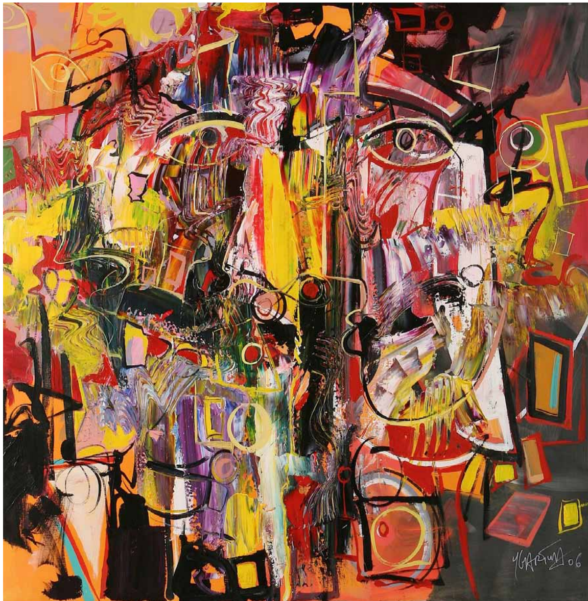
above, Dantes Inferno , acrylic on canvas, 48" x 48"